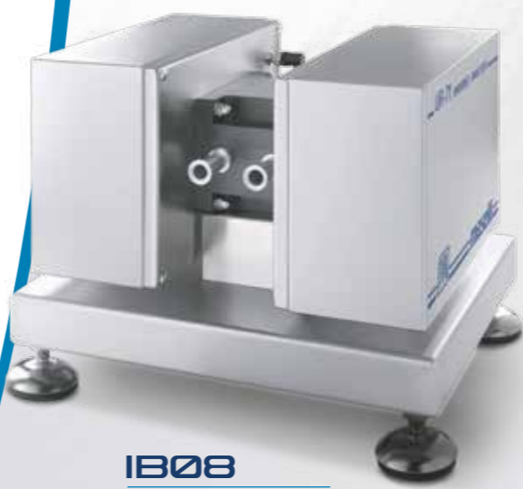
IB08 Brix-Diet CO 2 P/T