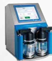
Laboratory - Diet Soft Drinks