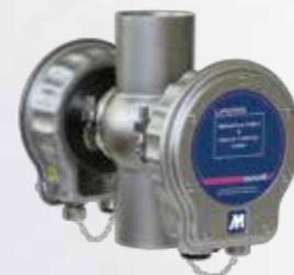
In line - Alcohol, Plato, Extract, CO 2