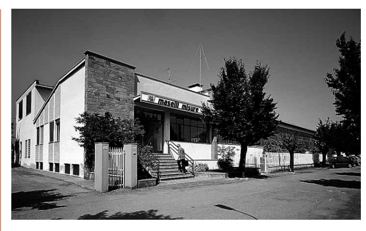
Maselli: an international group contributing to the evolution of liquid analysis.

Maselli Misure has been making a decisive contribution to knowhow and technological evolution in quality control and liquid analysis systems since it was established in 1948. Today it is one of the few Italian companies in a position to design and directly produce: evaluation of raw material consignment systems; both on-line and laboratory multiparametric liquid analyzers.