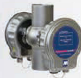
In line - Alcohol, Plato, Extract, CO 2