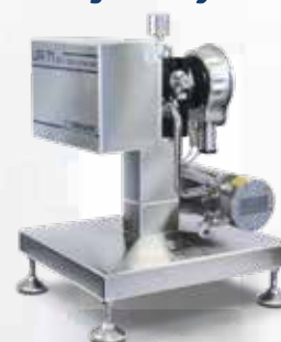
In Line - Bx / Diet / CO 2